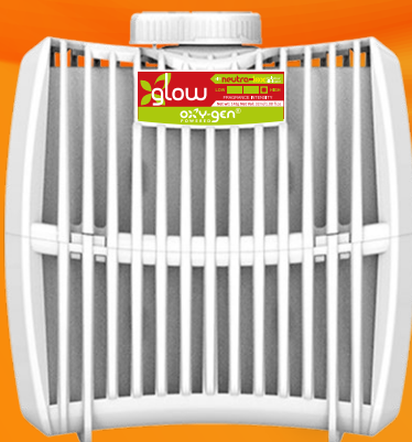
Grande Cartridge 30/60/90 Days

Clean, stylish, modern and functional design for every facility