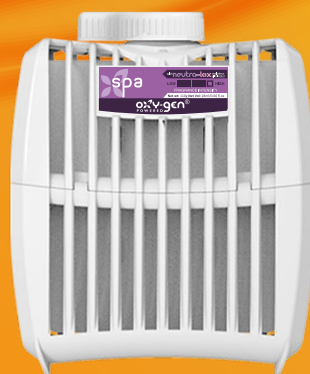
Regular Cartridge 30 Days